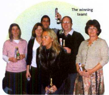
The winning team!