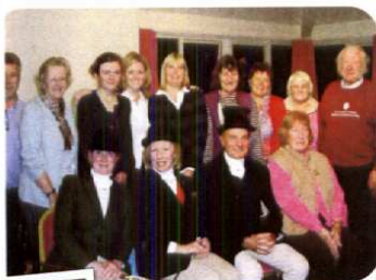
Left: BHS Cumbria Quiz winners